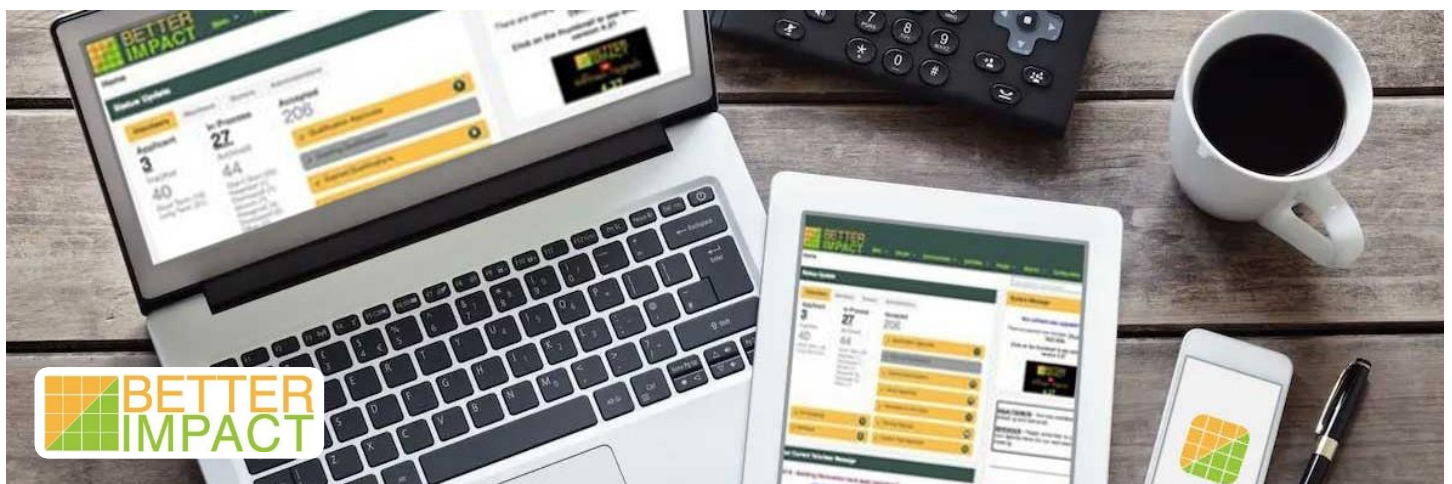
▲ Team Hope's new online volunteering sign-up system

This year some of Team Hope's Local Checking Centres are again using our new ONLINE SIGN-UP system especially for Corporate volunteer teams. This makes it easier to track and engage with you and your colleagues getting involved with in-person volunteering. When signing-up online for in-person volunteering you'll be invited to fill in an application form so please include your Business Name; Function and Location in the Address Line 1 as well as your full name; mobile number and business email please. Up to nine Checking Centres last year are using this new volunteer management software called Volunteer Impact (provided by Better Impact). Each of these Centres has a unique url link, so you and your colleagues simply click on the Centre you'd like to volunteer with; enter in some personal details to set up your own volunteer profile; view open shifts available and then sign-up online. Once you've set up up your volunteer profile, you can also download the app (iOS or Android) to see the volunteer shifts you've signed up for on your smartphone.