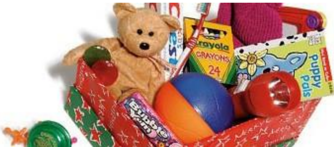
▲ A Gift-filled shoebox with all the ‘4 W’s’

*The €4 online shoebox donation goes towards the cost of making the Shoebox Appeal programme happen, including promotion, buying the items to fill the box, transport and delivering your box to each child. If there are any surplus funds, they are used for on-going development work with children, their families and communities. Details of this work, alongside Team Hope’s annual audited accounts can be found on our website www.teamhope.ie .