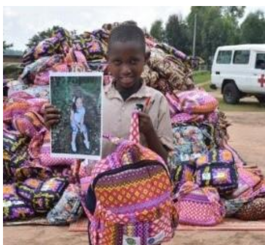
▲ Smiling children in DRC (L) and (R) receiving a gift filled school bag