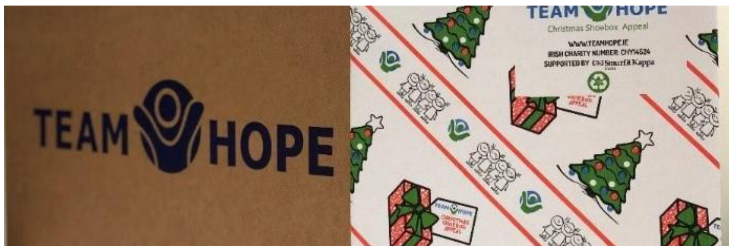
▲ Box containing 50 flat pack shoeboxes

Flat Pack Shoeboxes are on sale across the country, helping you to get involved in the Christmas Shoebox Appeal and supporting the work of Team Hope. This year our Flat Pack Shoeboxes can be purchased in two ways: