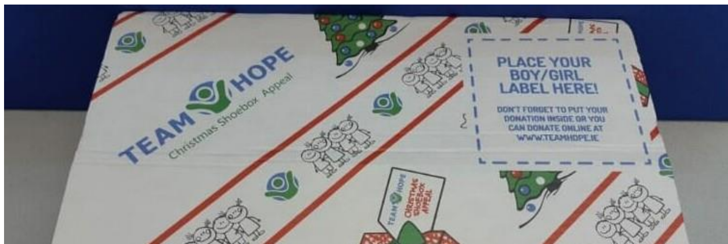
▲ Shoebox after assembly

As part of Team Hope's Christmas Shoebox Appeal this year, there will be a limited number of our Flat Pack Shoeboxes available . These are available to purchase, making it easier to participate in the Appeal by donating gift-filled shoeboxes - no more hassle hunting around for old shoeboxes plus no wrapping required!