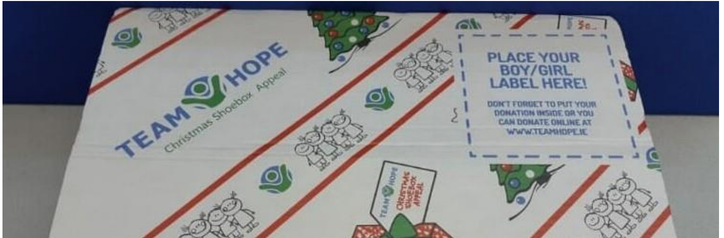
▲ Shoebox after assembly

As part of Team Hope's Christmas Shoebox Appeal this year, there will be a limited number of our Flat Pack Shoeboxes available . These are available to purchase, making it easier to participate in the Appeal by donating gift-filled shoeboxes - no more hassle hunting around for old shoeboxes plus no wrapping required!