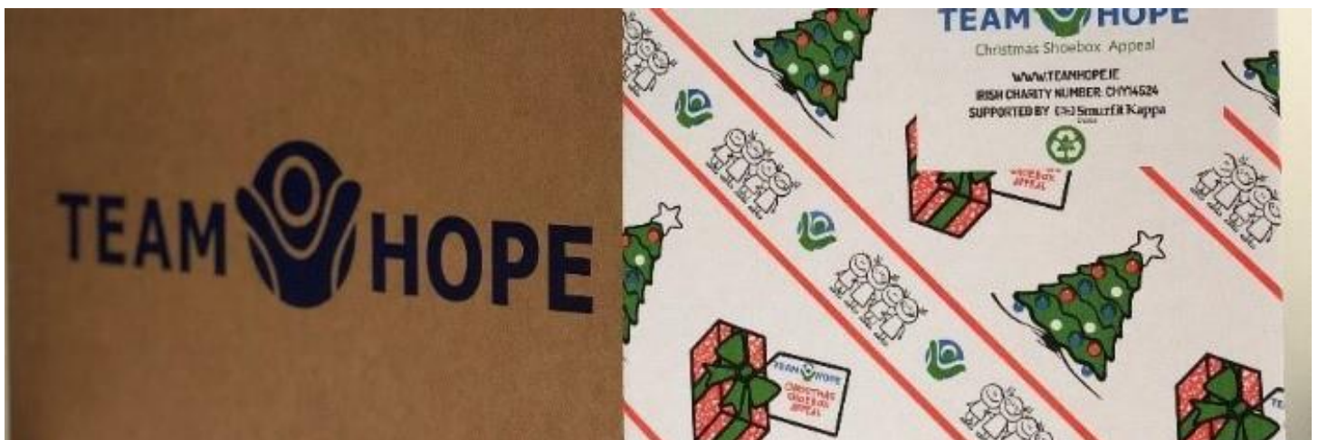
▲ Box containing 50 flat pack shoeboxes

Flat Pack Shoeboxes are on sale across the country, helping you to get involved in the Christmas Shoebox Appeal and supporting the work of Team Hope. This year our Flat Pack Shoeboxes can be purchased in two ways: