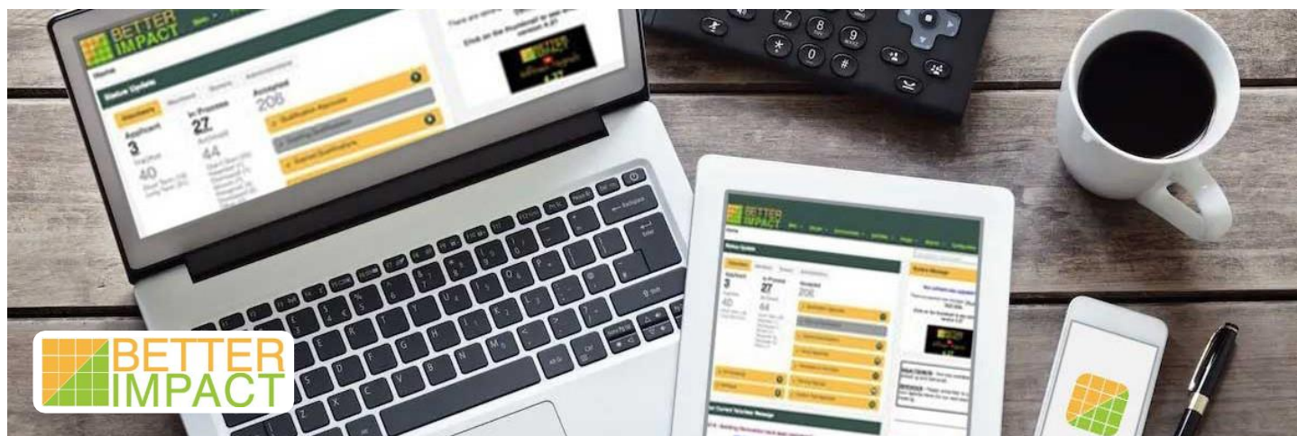
▲ Team Hope's new online volunteering sign-up system

This year some of Team Hope's Local Checking Centres are again using our new ONLINE SIGN-UP system especially for Corporate volunteer teams. This makes it easier to track and engage with you and your colleagues getting involved with in-person volunteering. When signing-up online for in-person volunteering you'll be invited to fill in an application form so please include your Business Name; Function and Location in the Address Line 1 as well as your full name; mobile number and business email please. Up to nine Checking Centres last year are using this new volunteer management software called Volunteer Impact (provided by Better Impact). Each of these Centres has a unique url link, so you and your colleagues simply click on the Centre you'd like to volunteer with; enter in some personal details to set up your own volunteer profile; view open shifts available and then sign-up online. Once you've set up up your volunteer profile, you can also download the app (iOS or Android) to see the volunteer shifts you've signed up for on your smartphone.