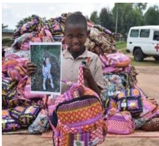
▲ Smiling children in DRC (L) and (R) receiving a gift filled school bag